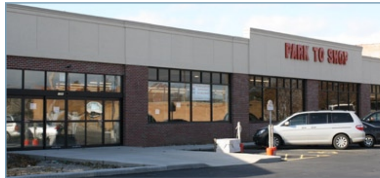
Park to Shop, an Asian grocery store, is the most recent addition to the Asia Plaza. The grocery store is scheduled to open in mid-December.

For more information on how you can support MidTown Cleveland, Inc., contact Diane Dunleavy at 216-391-5080, ext. 101, or via email, ddunleavy@midtowncleveland.org.