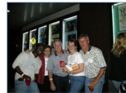
Nearly 400 MidTown supporters came to MidTown Cleveland, Inc.'s block party at the Agora Theater on Thursday, September 27 to honor both the history and future of the MidTown neighborhood. Partygoers, including MidTown Cleveland, Inc.'s staff, enjoy the evening's festivities.