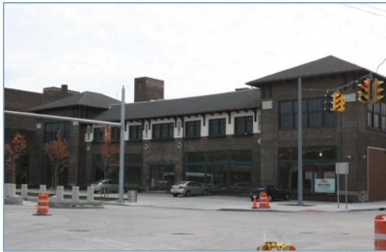
The Baker Electric Building, 7100 Euclid Ave., originally a showroom for electric cars sold to area aristocrats, has been renovated to combine elements of the building's history with modern, environmentally-friendly amenities.

Built In 1910, the Baker Electric Motor Car Building, 7100 Euclid Ave. was once a showroom for cutting-edge electric cars purchased by those who inhabited the prestigious area surrounding Millionaire's Row. Almost a century later, Cumberland Development, LLC, is transforming the space to reflect its history of innovation by turning the Baker Electric Building into lab and office space for medical start-ups and technology companies.